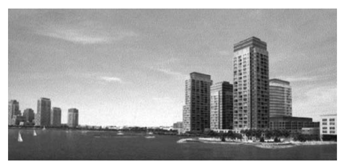
The "Radiant City's" towers-in-the-park paradigm may have its most recent incarnation in the above proposal for the Williamsburg-Greenpoint waterfront, two blocks away from where the picture on the left was taken.