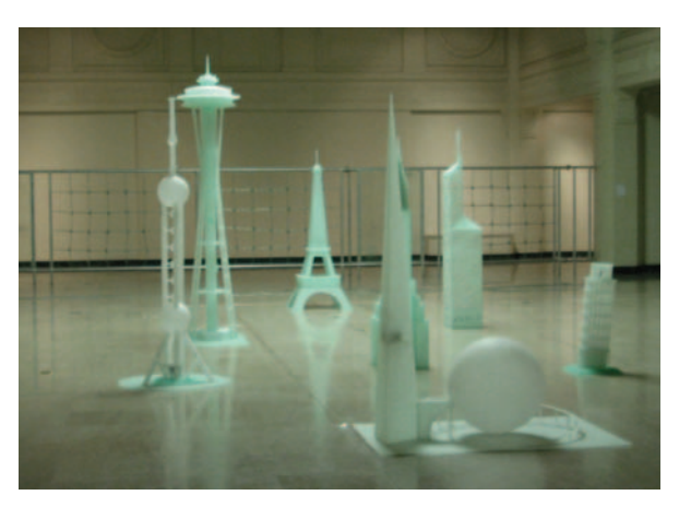
Jude Tallichet All Star, 2002 Sandblasted acrylic and eight channel sound, dims. variable Sara Meltzer Gallery

Heidi Schlatter Untitled (garage), 2002–2005 Photo on vinyl 89" x 115.5"