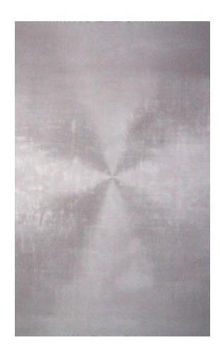
R.H. Quaytman Chapter 5, UBS, 2005 Detail of silkscreen on wood