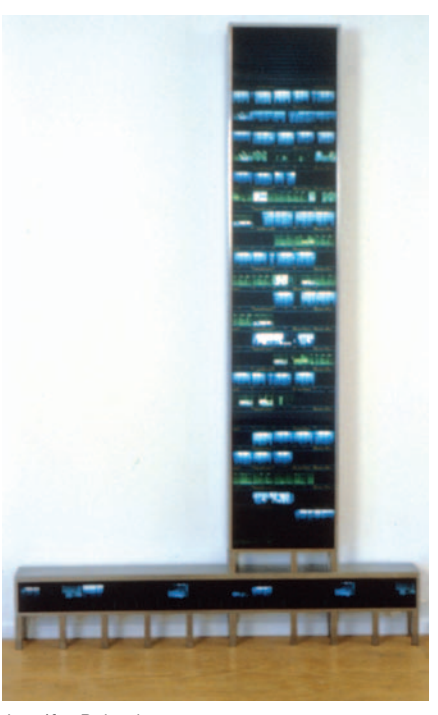
Jennifer Bolande Appliance House, 1998–99 Duratrans/lightboxes steel frame 91" x 59" x 5" Courtesy Alexander and Bonin Gallery

Michael Ashkin's scale model sculptures primarily depict industrial waste sites on the outskirts of the city, forgotten zones that exist uneasily in post-industrial society's collective unconscious. Because of the high degree of detail in the work, the usual sketchiness of this nebulous territory is brought into crisp focus, elevating an ordinarily marginal area of the built environment to a featured role in an open-ended narrative on the fate of seemingly abandoned territory. On the fringe of a city where all space is spoken for, Ashkin's work references little noticed places one might get glimpses of along the highway from New York to New Jersey, which possess fading evidence of the human activity that's left its mark on the sites. Vastly reduced in scale from their subjects and framed by their base, the sculptures assert filmic qualities of mood and character while articulating the side effects of industrial production in areas abandoned to uncertain use.