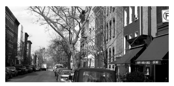
Williamsburg, Brooklyn's "pedestrian street" looking towards the waterfront.

the everyday, like the "voluntary simplicity" of Real Simple magazine, they generally are geared only to the affluent, a thinly veiled ambition to sell "less" as "more" to those who have plenty. For the rest there's the non-stop Baroque of violent fantasies, reality shows featuring "regular" people (another attempt to market the ordinary, but as humiliation and farce), S.U.V.'s charging valiantly through untouched nature, and the routine horror of distant conflicts.