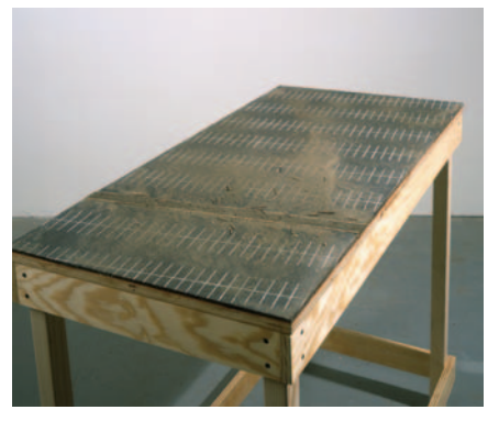
Michael Ashkin No. 107, 1999 Mixed media 35" x 20 3/4" x 41 7/8" Andrea Rosen Gallery

Beaumont Camouflages Cells, Azusa, CA, 2004 Digital c-print 42" x 30" Courtesy of the artist